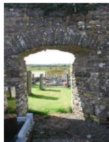
Chapel of St. Michael in Kilmihil, Ireland