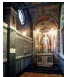
Chapel of the Sacred Heart and St. Michael in Westminster Cathedral, UK