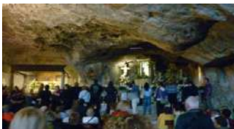
St. Michael's Cave in Gargano, Italy