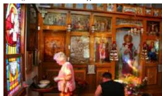
St. Michael's Chapel in Tarpon Springs, Florida