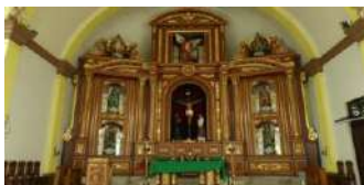
San Miguel Church, Manila, Philippines