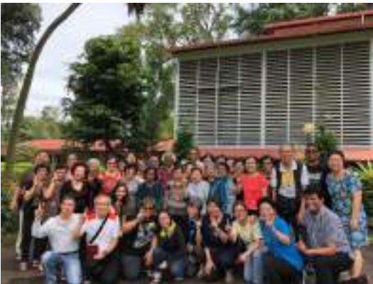
3 rd Inter- Ministry Batch (12 to 13 May): Rite of Christian Initiation for Adults (RCIA), Society of St. Vincent De Paul (SSVP), Bethany Prayer Group