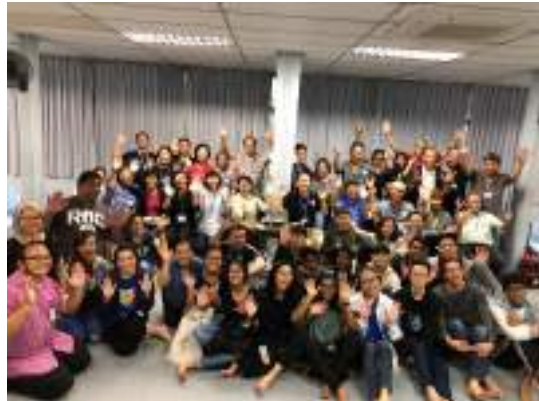
4 th Inter- Ministry Batch (26 to 27 May): Comms Ministry, Young Adults Community, Youth Ministry, Wardens, Knights of the Altar