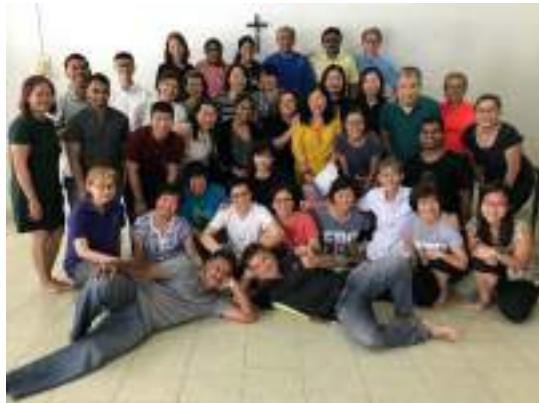
2 nd Inter- Ministry Batch (28 to 29 Apr): Catechist Ministry, Extraordinary Ministers of Holy Communion (EMHC)