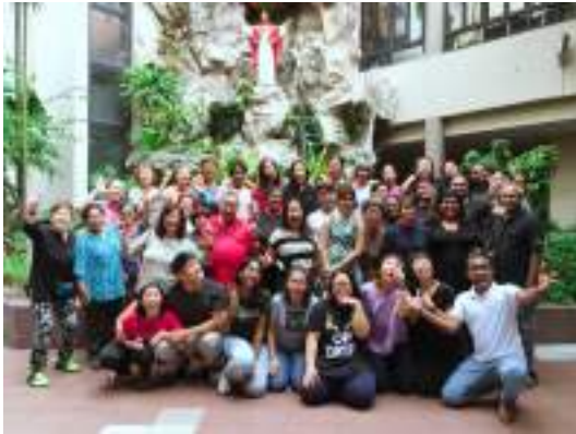
1 st Inter- Ministry Batch (21 to 22 Apr): Ministry of Lectors, Choirs, Neighbourhood Christian Communities (NCC)