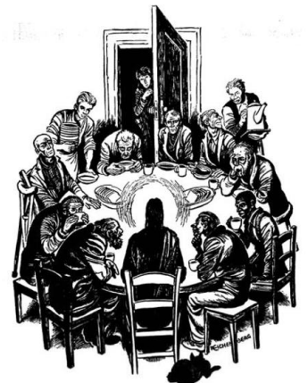
THE LORD'S SUPPER (1953)